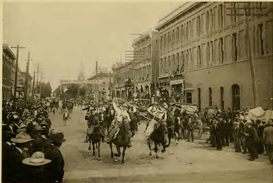
COWBOYS ON PARADE.